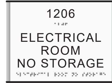
D6x8CP ADA Room Sign