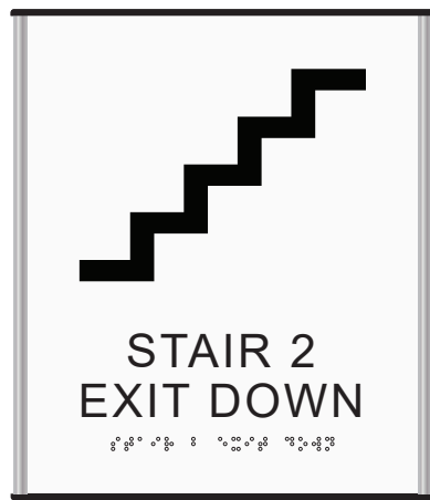
D9x8CP Stair ID / Staff Restroom