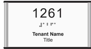
D3x6CPT ADA Office Sign (updateable)