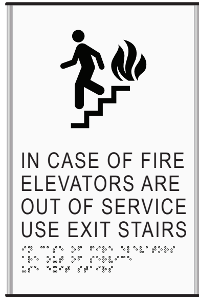
D11x8.5CP In Case of Fire