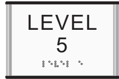
D3x5CP ADA Floor Level ID