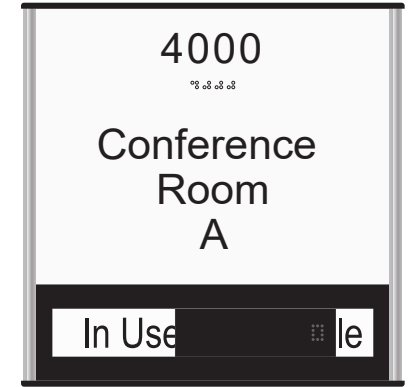
D8x8CPT-SL ADA Room Sign