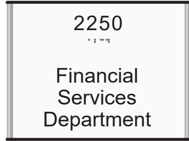
D6x8CPT ADA Room Sign (updateable)