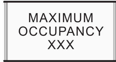
D4x8CP Max Occupancy