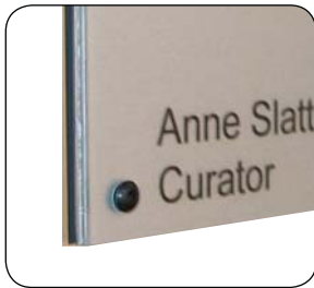
Available with Allen Bolt