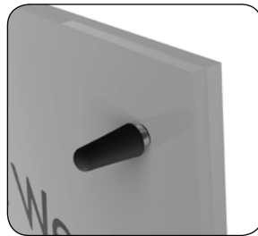
Elegant Ultra-Thin Profile